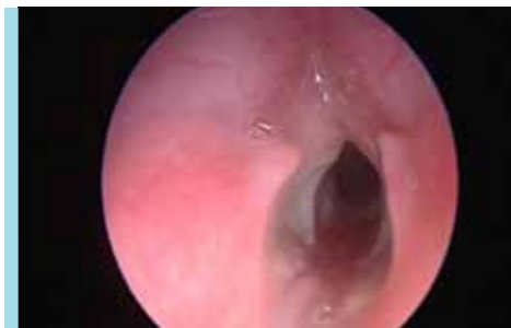
Figure 2: Post-treatment