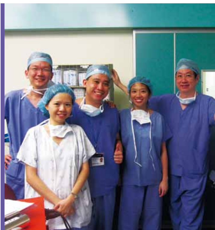
Team of KKH doctors who completed the first robotic surgery at KKH.

KKH introduced the use of robotic surgery for O&G conditions with the first such surgery performed in September 2011.